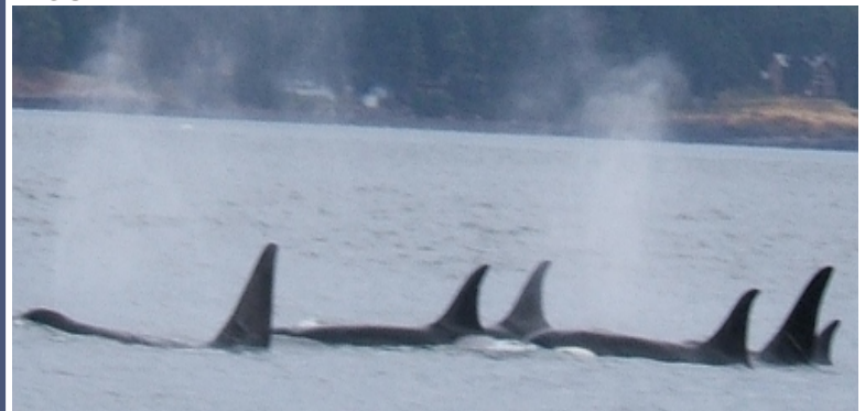
L Pod at rest (summer 2005)