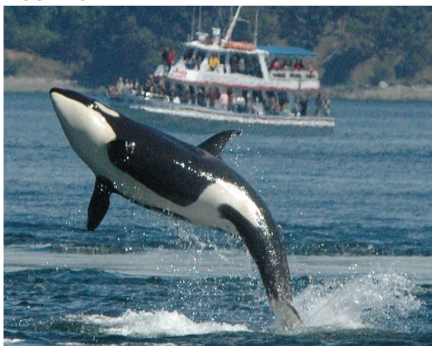
J40, baby girl breaching (summer 2005)

seals) on icebergs. However, the Southern Resident Orca eat primarily salmon and don't need to see what's above the water. Scientists speculate that the Orcas spy-hop to examine the boats that are observing them.