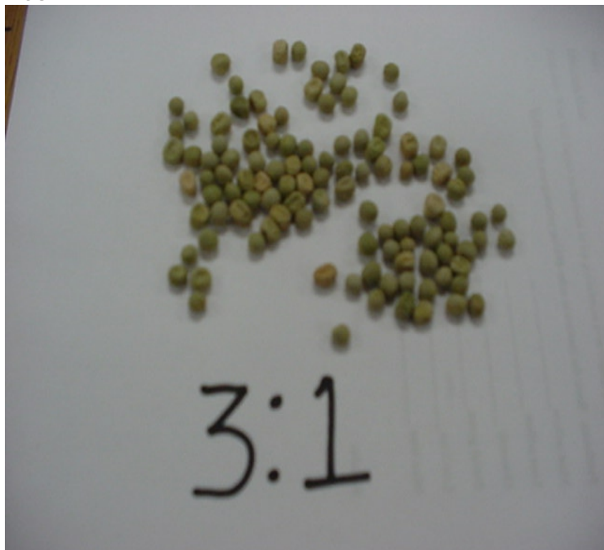
Pea samples are observed, sorted and explained by students.

This is an appropriate time to introduce the concepts phenotype and genotype. Furthermore, I usually begin to define the color unit as a "factor" as this is the term that Mendel used to explain inheritance. At a more appropriate time, we will begin to refer to these "factors" as alleles. With effective