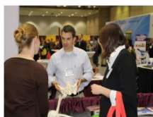
ICTM-ISTS Math Science Conference