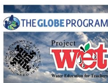
IAS Science Education Programs