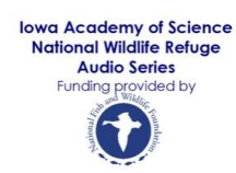
IAS NWR Audio Series