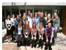
Iowa Junior Academy of Science