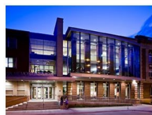
2015 IAS Annual Meeting