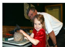
IAS Speaker Series at Saylorsville Lake