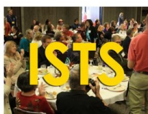
Iowa Science Teaching Section