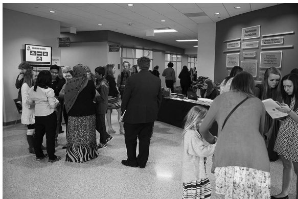
IJAS Science Symposium

Promoting the study of and participation in science by elementary, middle, and high school students.