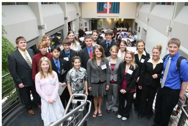
2008 Iowa Junior Academy of Science Participants at IAS Annual Meeting