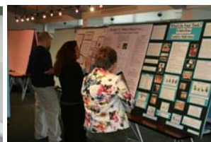
AM Poster Session