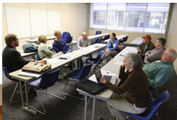
Iowa Natural Heritage Association Workshop at the IAS Annual Meeting