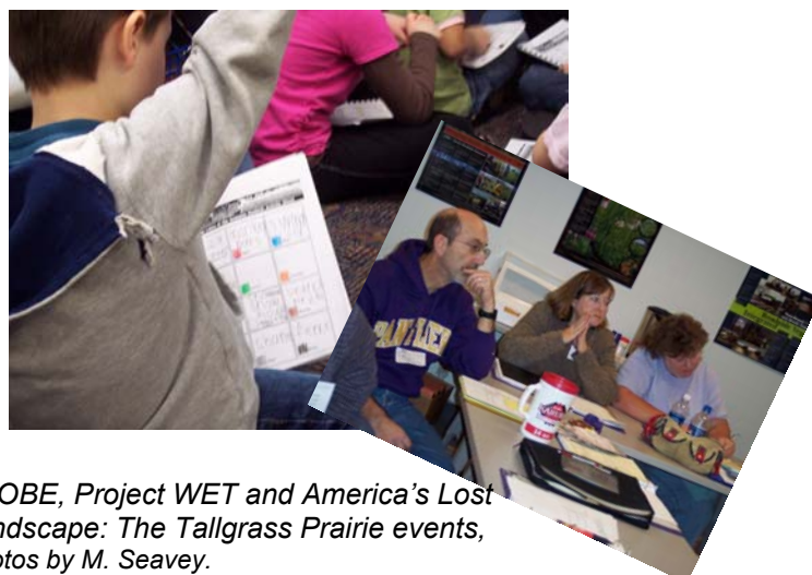
GLOBE, Project WET and America's Lost Landscape: The Tallgrass Prairie events, Photos by M. Seavey.