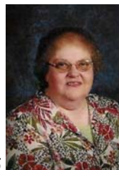
Candidate for ISTS Section Treasurer

Your ballot will only include a section to vote on the ISTS Officers if you are currently a member of the ISTS Section.